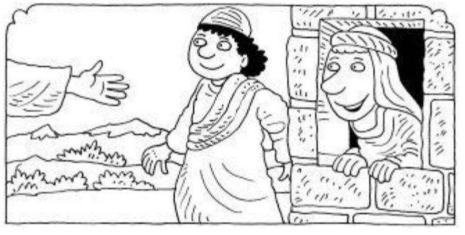
Thomas was a tax collector too. He and James also left everything behind when they went and followed Jesus. The disciples were Jesus' helpers.