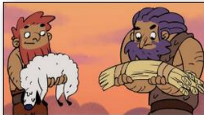
Cain and Able

Clues and words from Hebrews 11:1 - 6 KJV