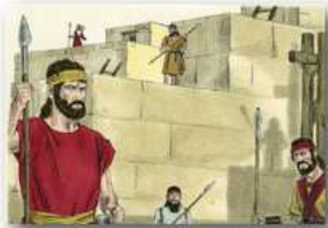
illustration from Sweet Publishing