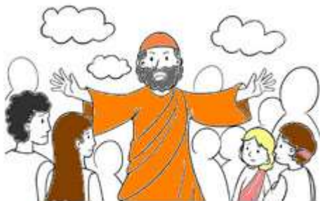
Celebrate ... Praise Jehovah