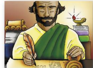
Paul writes to the Philippians