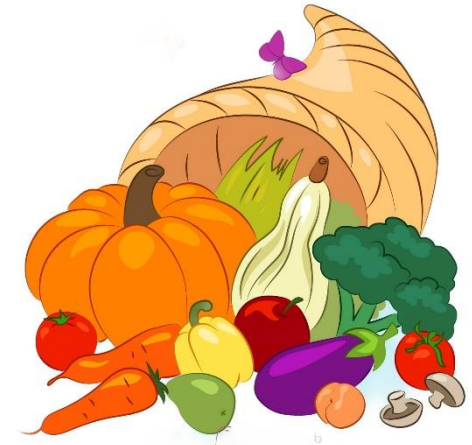
Fruit of the Spirit